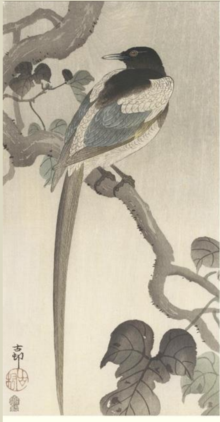
1 Black-billed magpie ( Pica pica ) by Koson Ohara , 190 x 355 mm