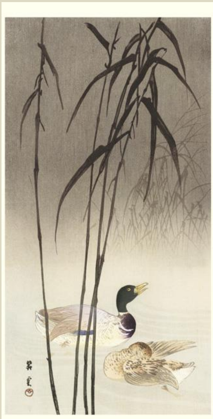
3 Mallard duck ( Anas platyrhynchos ) by Shōun Yamamoto, 190 x 365 mm